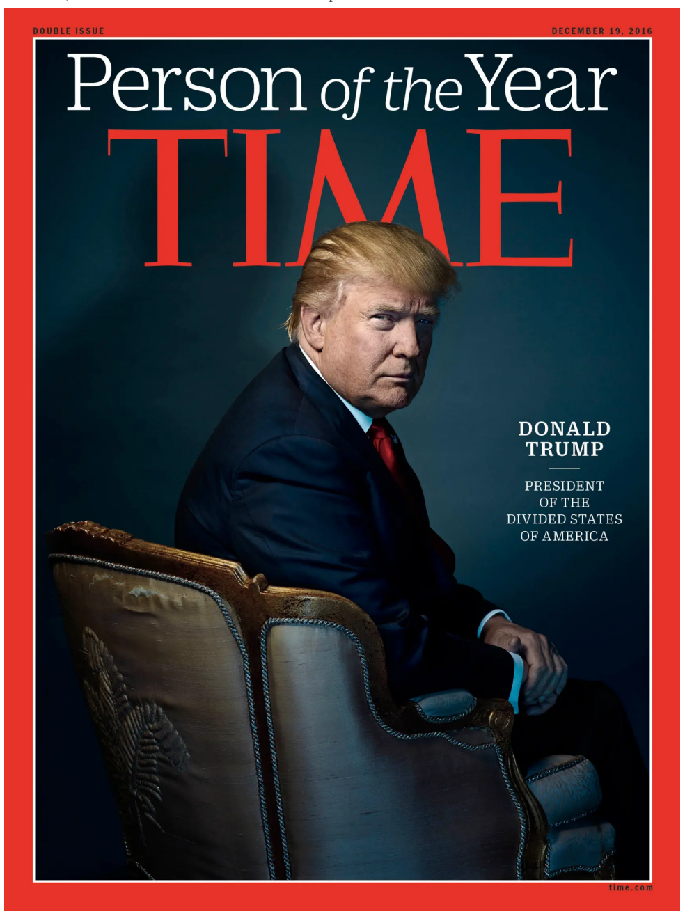
2016: Donald Trump TIME