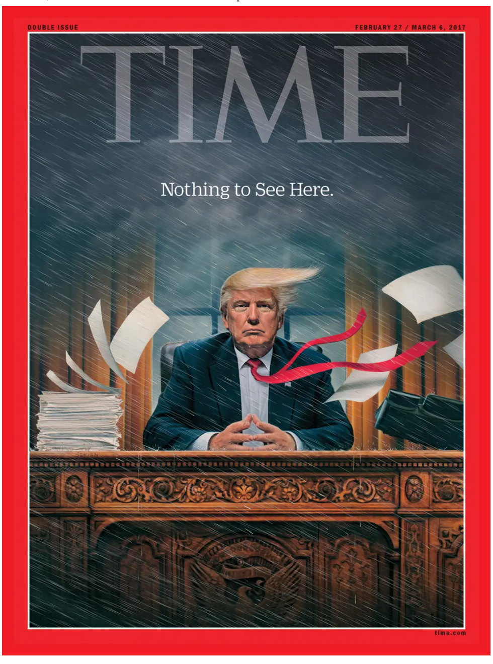
Illustration by Tim O'Brien for TIME