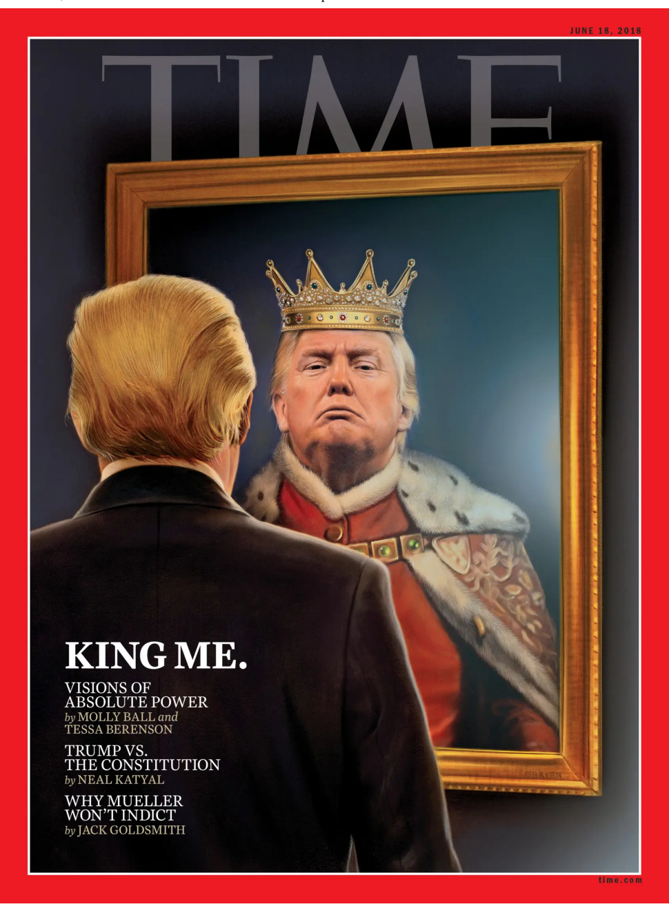
Illustration by Tim O'Brien for TIME