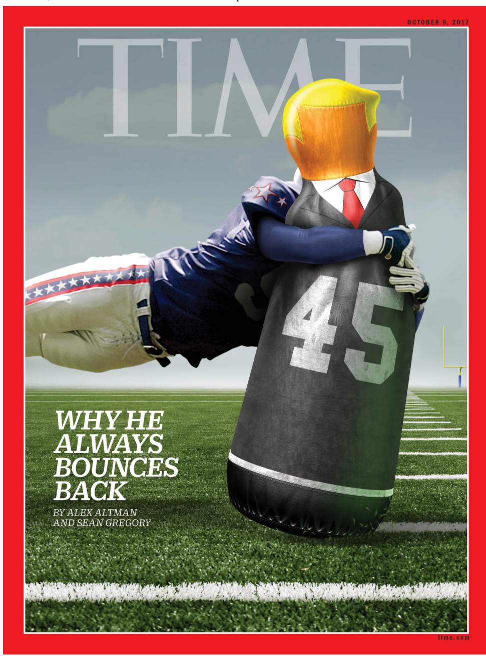
Photo-illustration by Brobel Design for TIME. Player: Jim Davis-The Boston Globe/Getty Images, Field: Sandro Di Carlo Darsa- PhotoAlto/Getty Images