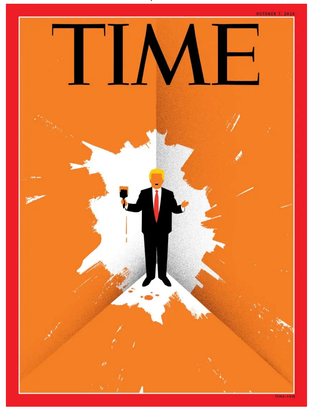
Illustration by Edel Rodriguez for TIME