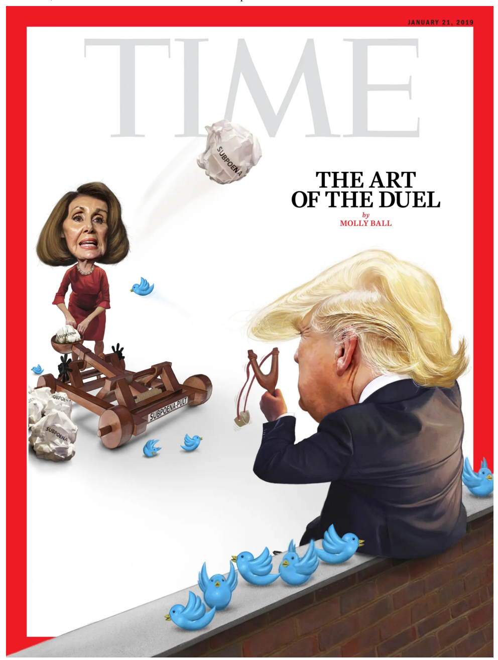
Illustration by Jason Seiler for TIME