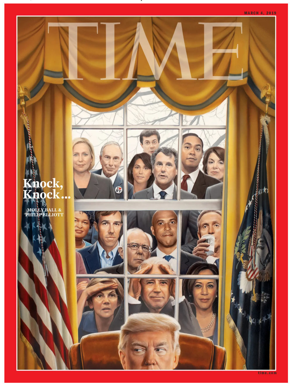
Illustration by Tim O'Brien for TIME