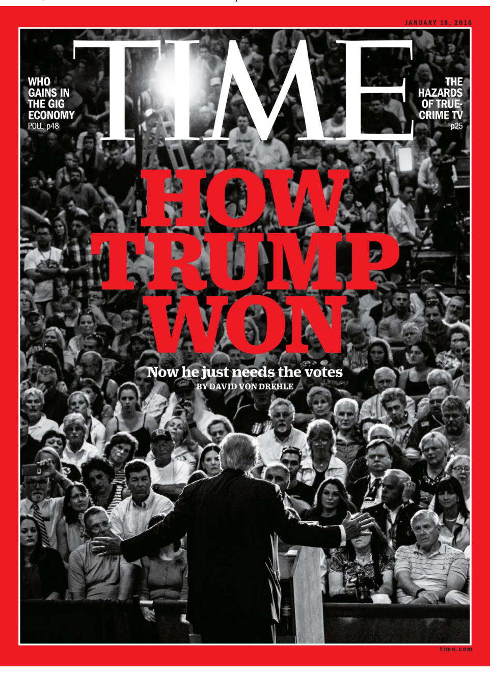
The Jan. 18, 2016 issue of TIME.