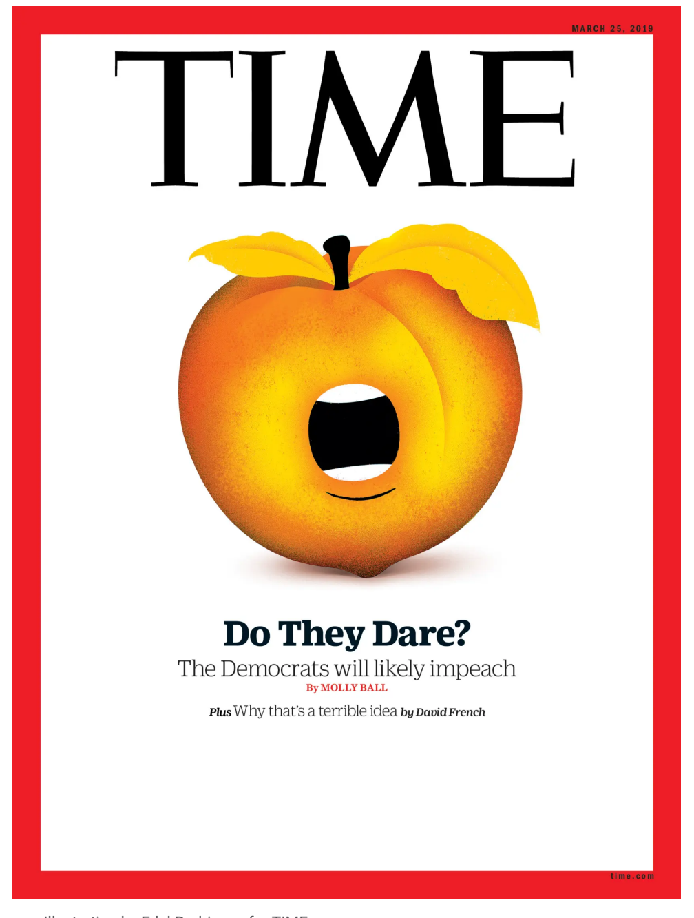
Illustration by Edel Rodriguez for TIME