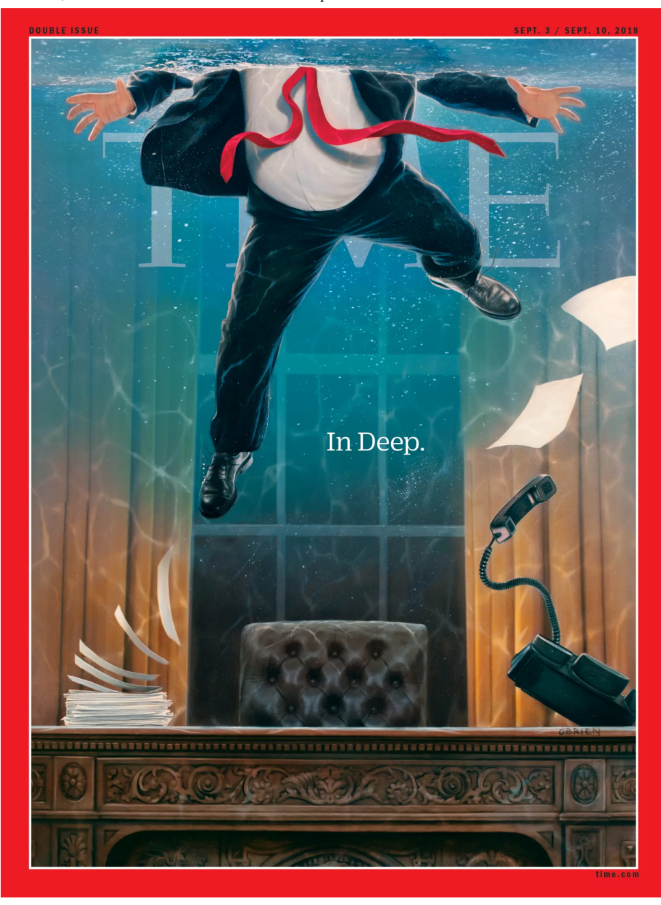
Illustration by Tim O'Brien for TIME