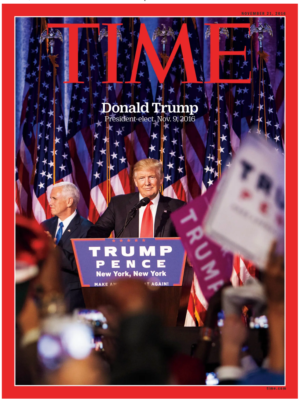
President-elect Donald Trump addresses supporters at his victory night party at 2:52 a.m. on Nov. 9 in New York City.