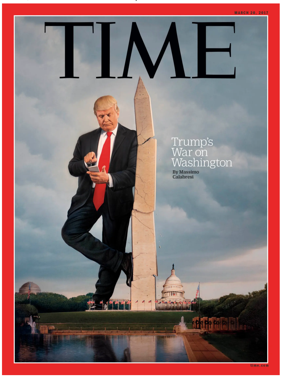
Illustration by Tim O'Brien for TIME