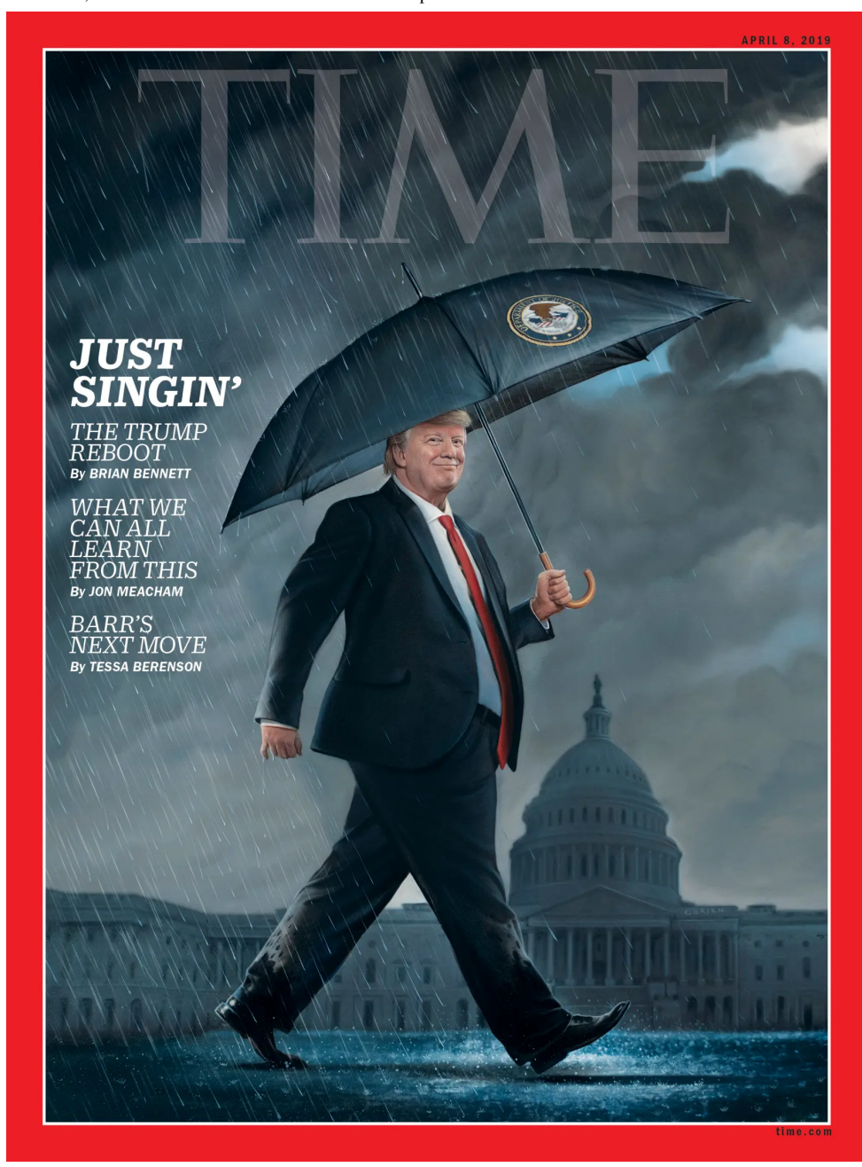
Illustration by Tim O'Brien for TIME