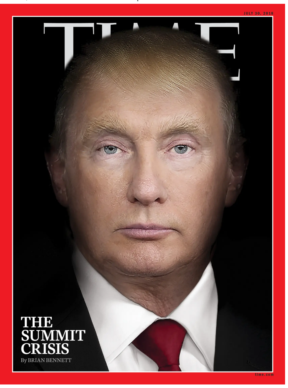
Photo illustration by Nancy Burson for TIME (Digital imaging by John Depew. Source photographs Trump: Getty Images; Putin: Kremlin handout)