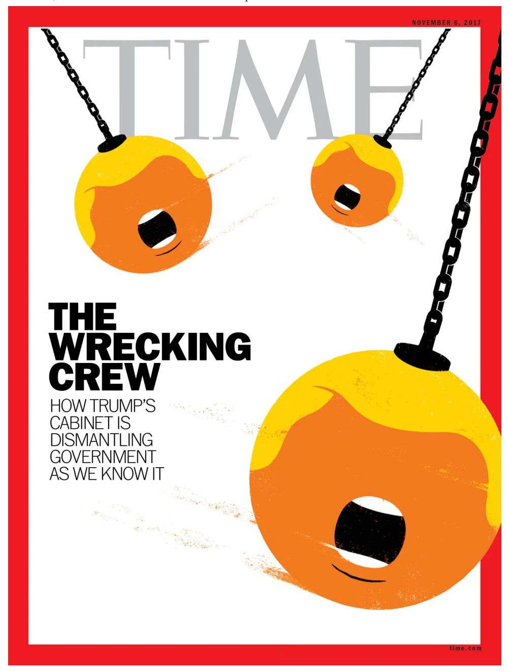
Illustration by Edel Rodriguez for TIME