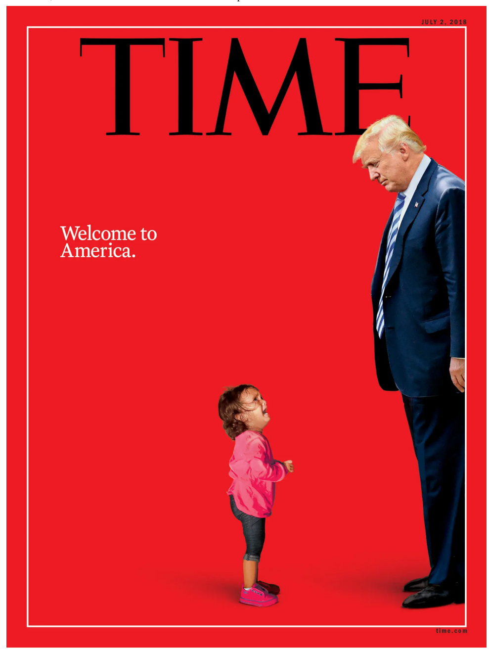
TIME Photo-Illustration. Photographs by Getty Images