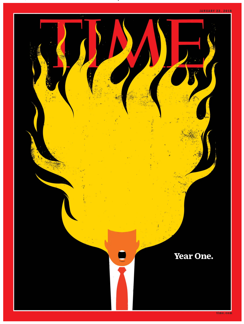
Illustration by Edel Rodriguez for TIME