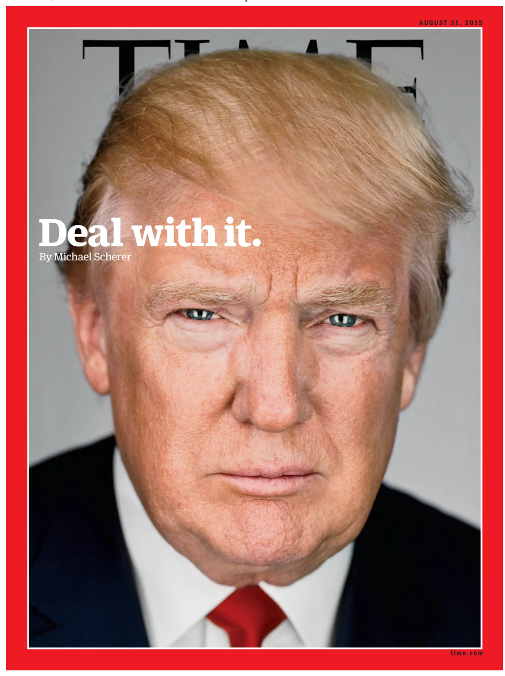
The Aug. 31, 2015 issue of TIME. \, TIME