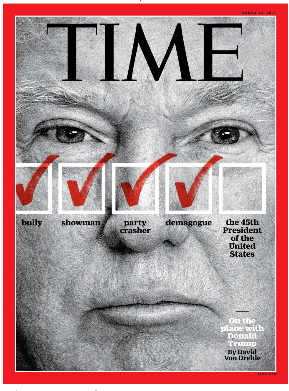
The Mar. 14, 2016 issue of TIME. TIME