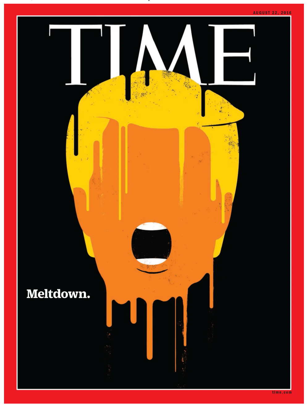
The Aug. 22, 2016 issue of TIME. Illustration by Edel Rodriguez for TIME