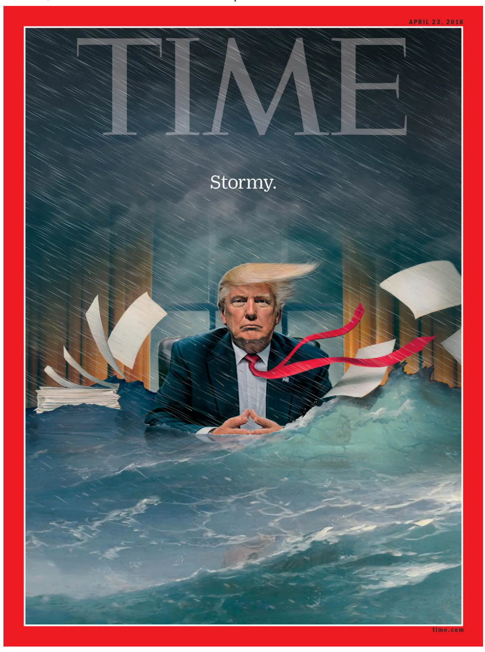
Illustration by Tim O'Brien for TIME