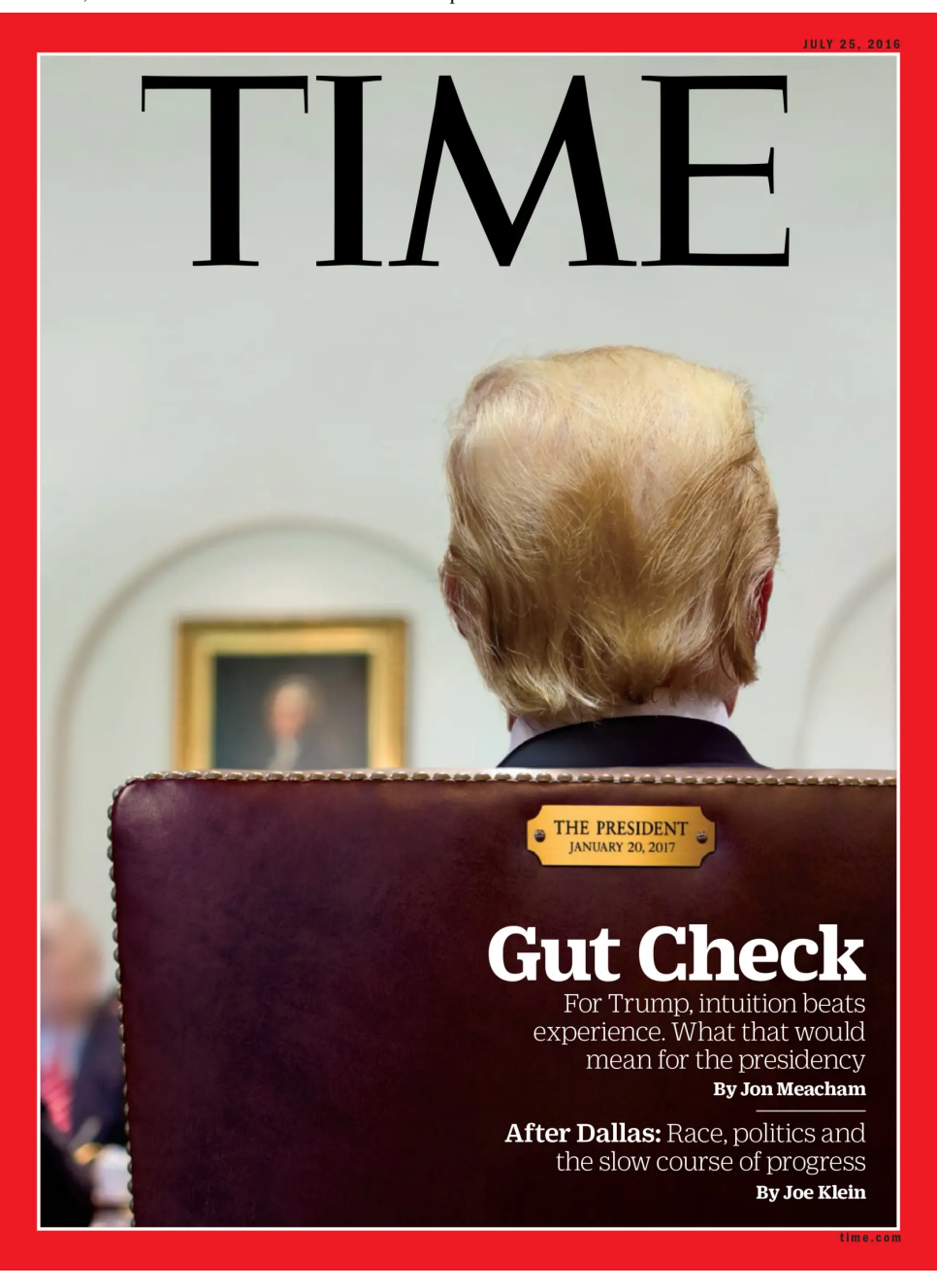
The Jul. 25, 2016 issue of TIME. TIME