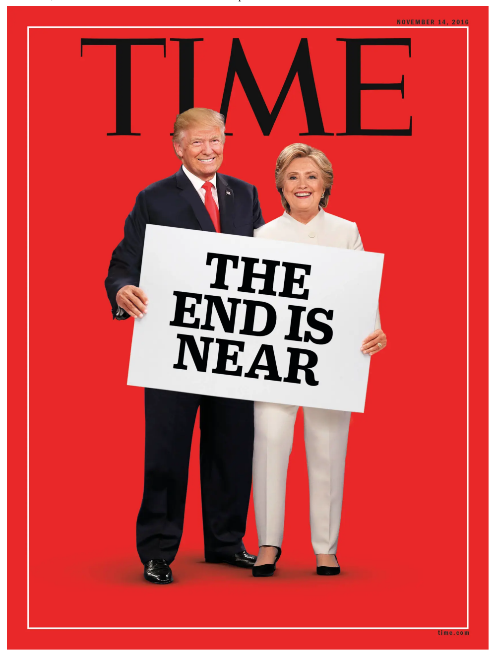
TIME Photo-Illustration. Photographs: Getty Images (5)